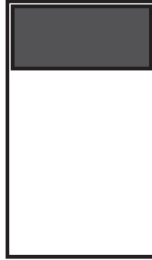
Quarter Page Ad Horizontal ($100) (3.5X2)*