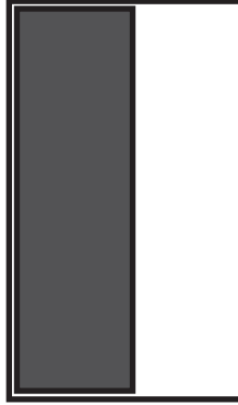
Half Page Ad Vertical ($200) (2X7.5")*