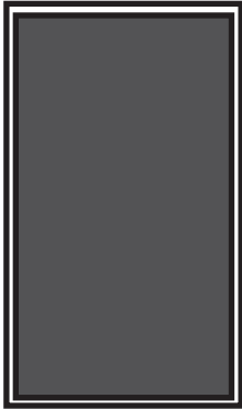
Full Page Ad $350 (4.5X7.5")*

Our Lady of Lourdes School 28th Annual Auction - February 2nd, 2008 Catalog Advertising Rates - Your ad will be seen by the 400+ auction attendees